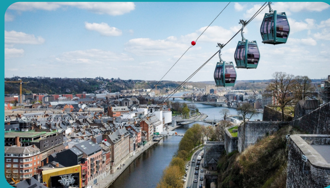
Namur's cable car