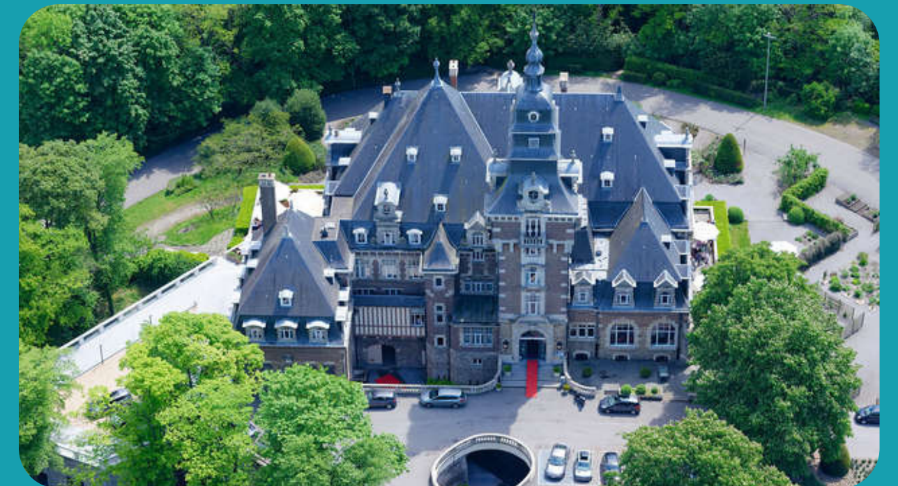
Castle of Namur