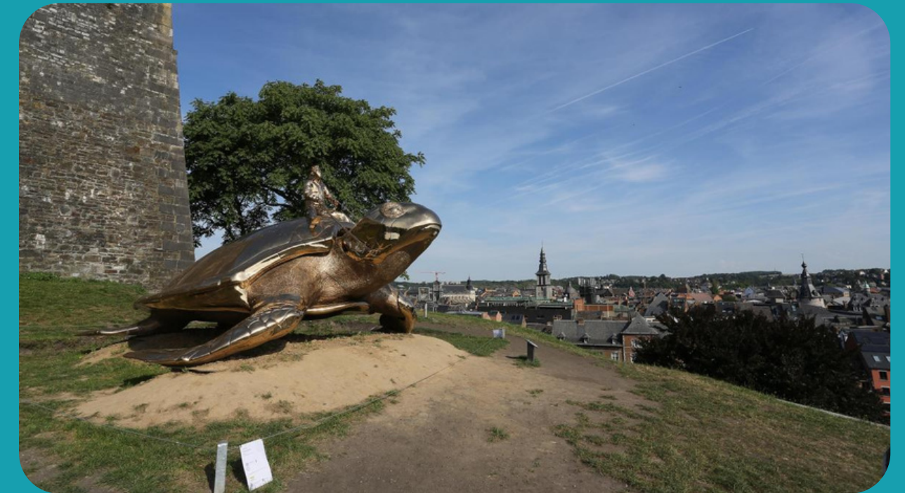
"Searching for Utopia"