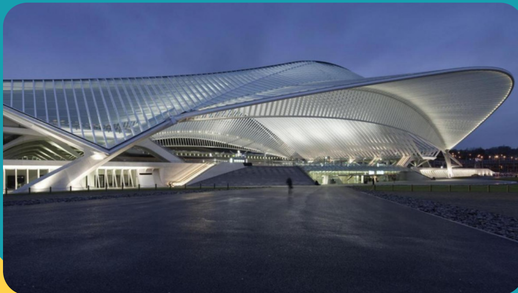
Train station of Liège

Liège offers numerous activities, both cultural and sporting, giving you the opportunity to explore the city to its fullest extent in your free time.