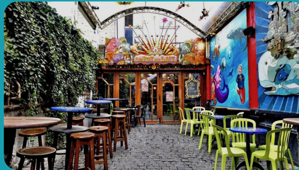
Bar the "Pot-au-lait"