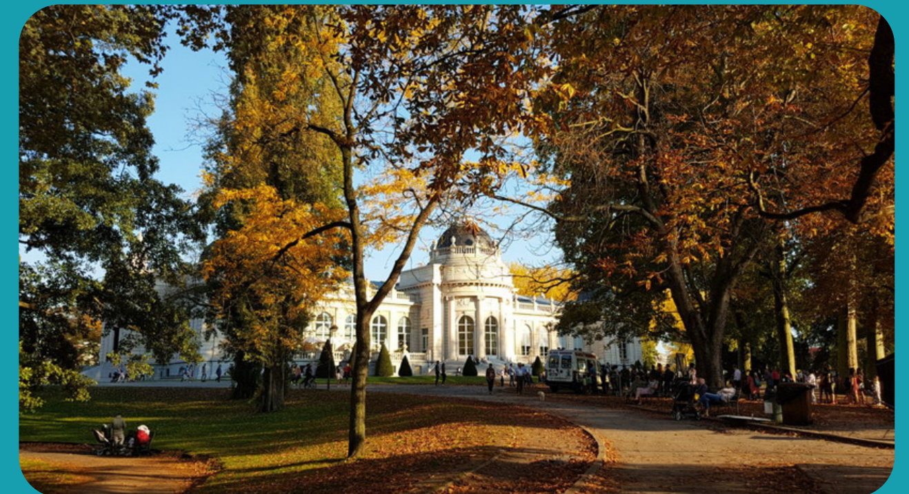
Park of the Boverie