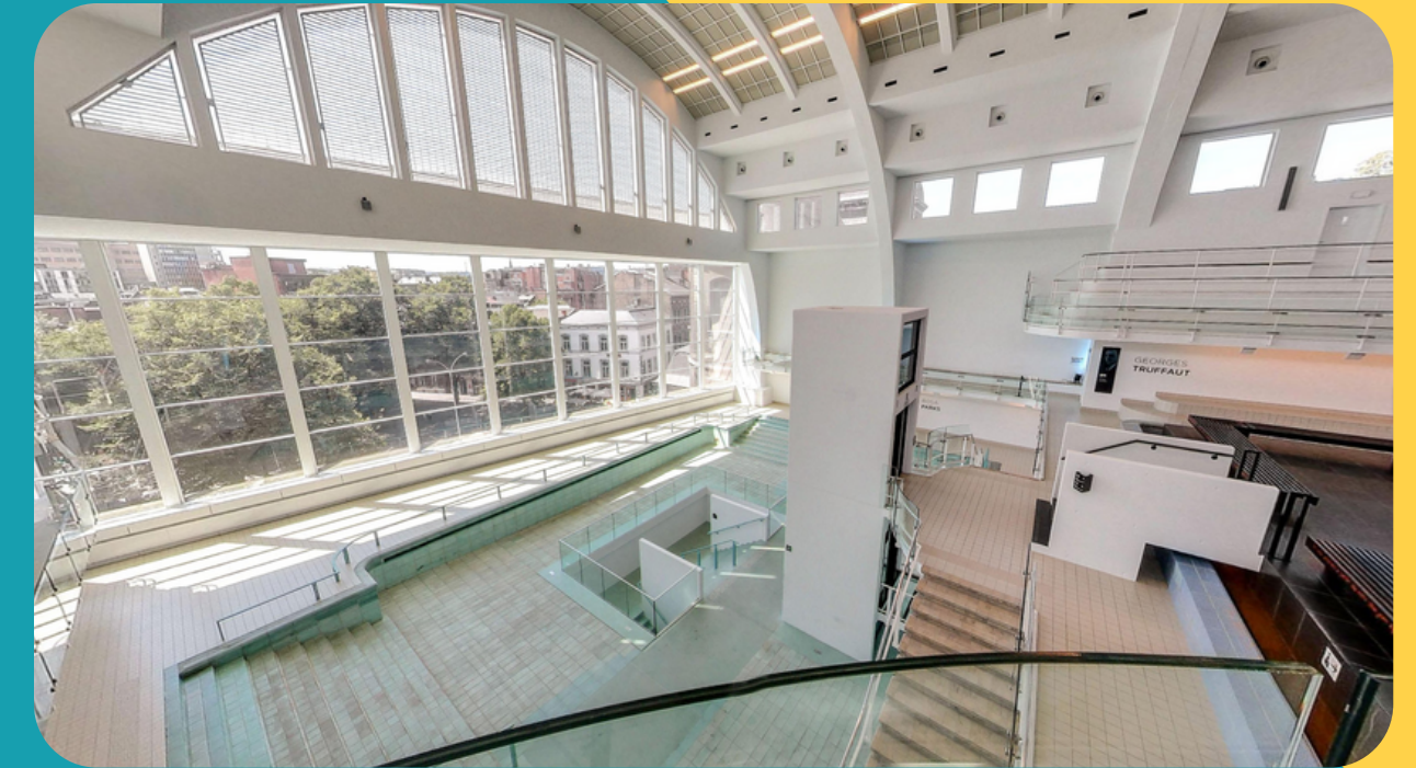
The mirror town