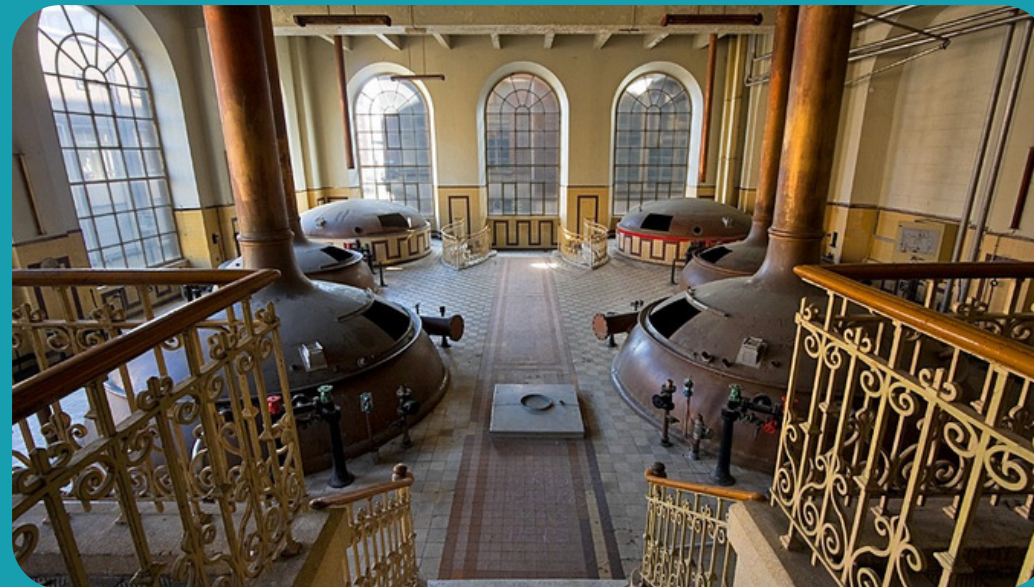
Stella Artois brewery