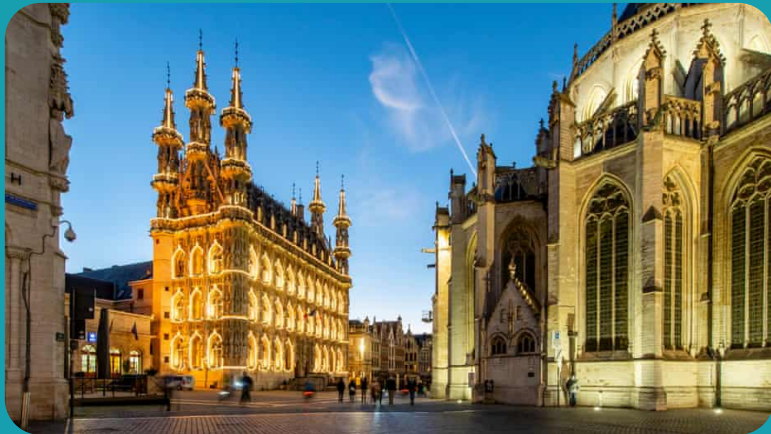
Historic city center

Streets full of bicycles, café terraces full of students, this is the atmosphere you will discover when you arrive in Leuven. Located in the heart of Flemish Brabant, Leuven is a small Belgian architectural jewel to visit but also a lively, welcoming and human-sized university town to experience. The city of Leuven is small in size but big in activity, it will surprise you at every corner.