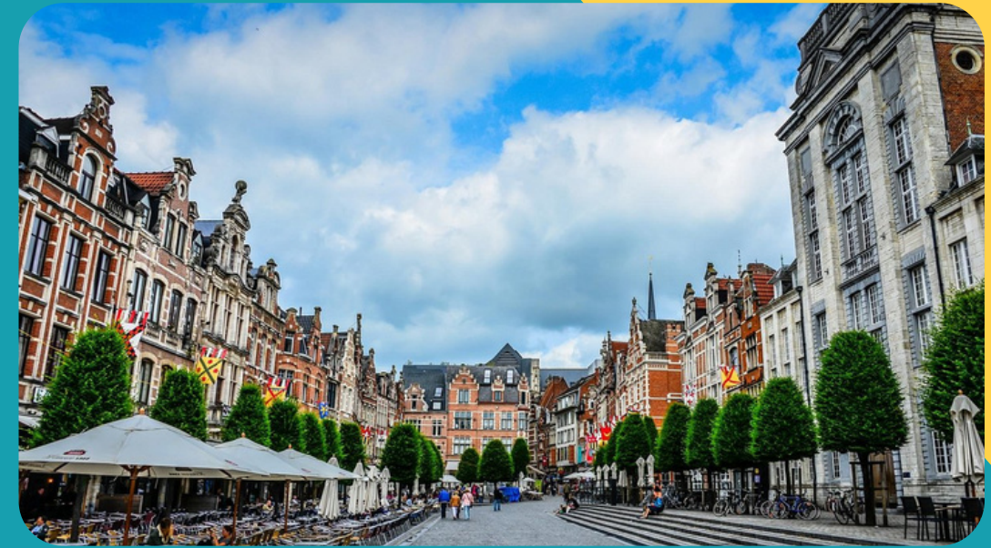
Old market square "Oude"