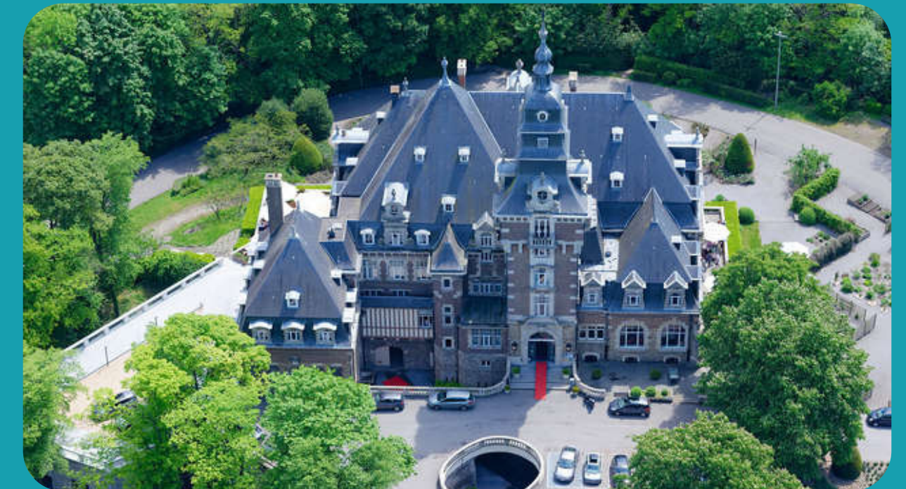
Castle of Namur