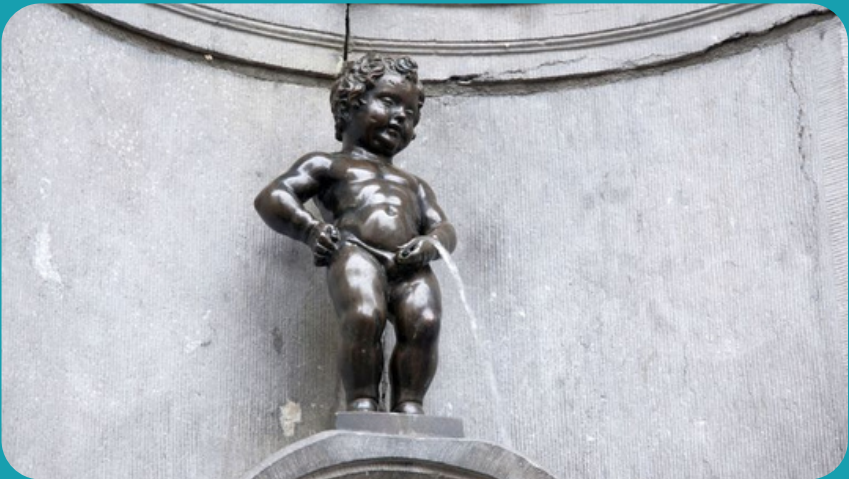
The Manneken Pis statue