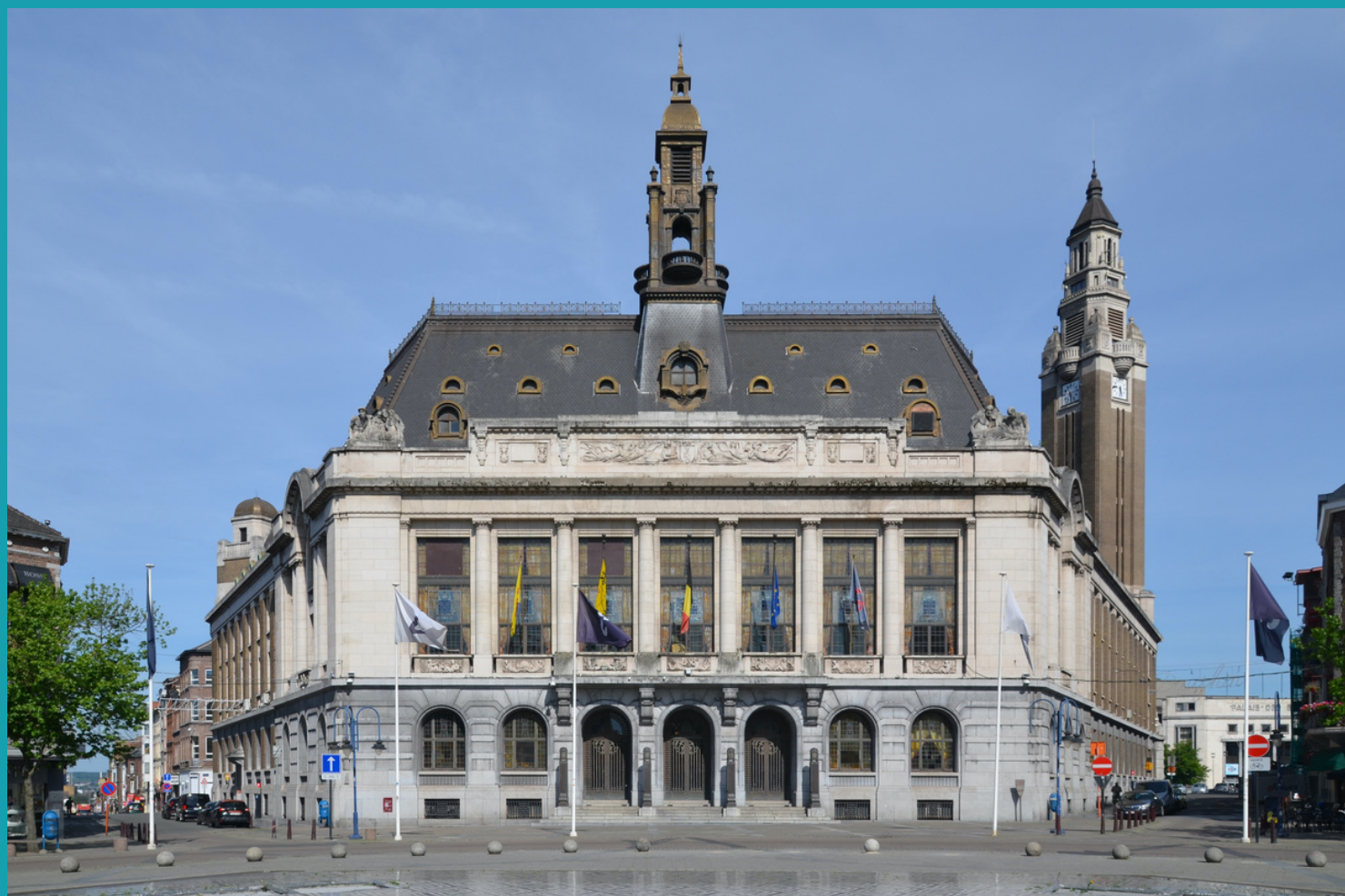
City hall of Charleroi

Charleroi is a French-speaking city in Belgium, located in Wallonia, province of Hainaut, on the river Sambre.