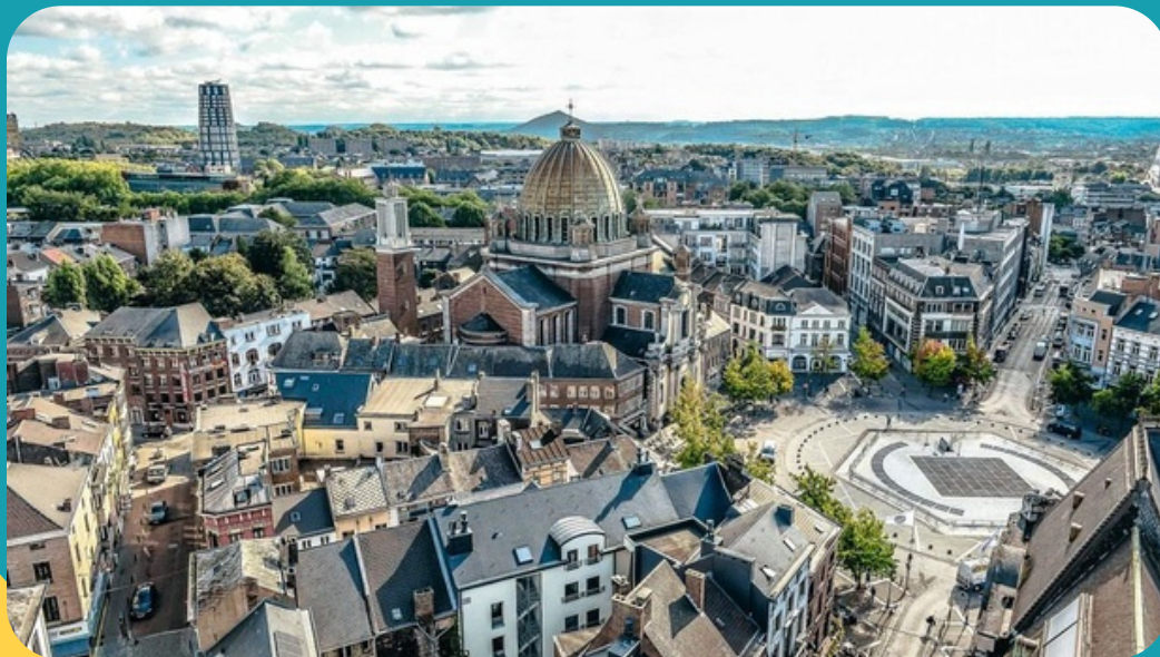
City center of Charleroi

Charleroi offers numerous activities, both cultural and sporting, giving you the opportunity to explore the city to its fullest extent in your free time.