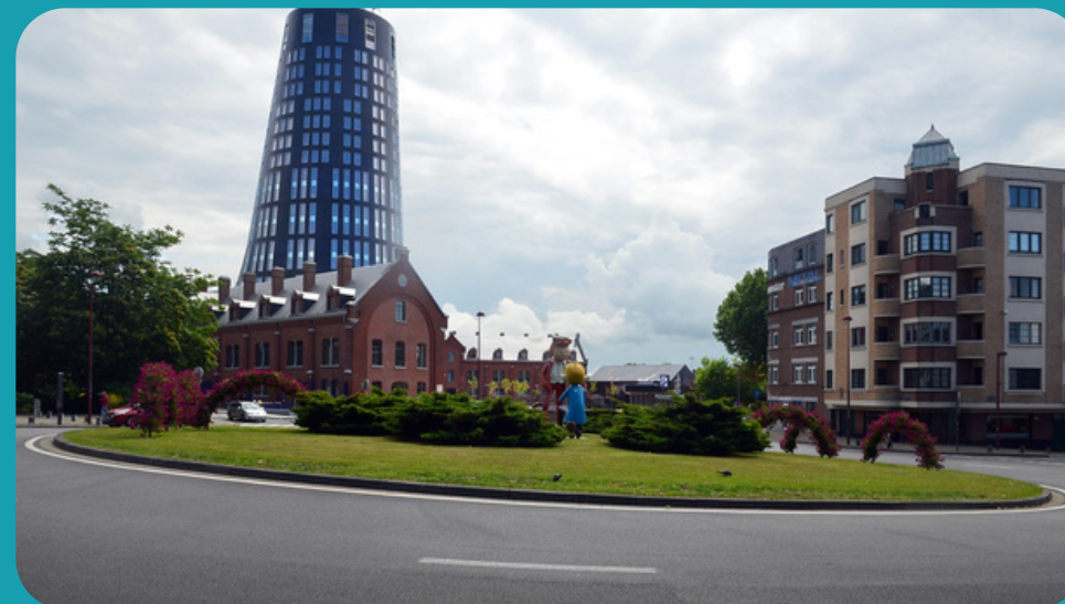
The blue tower