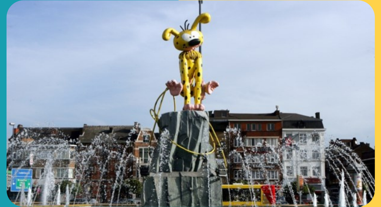
Monument of Marsupilami