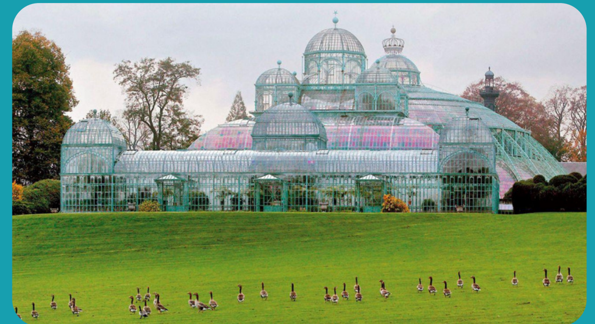
Royal greenhouses of Laeken