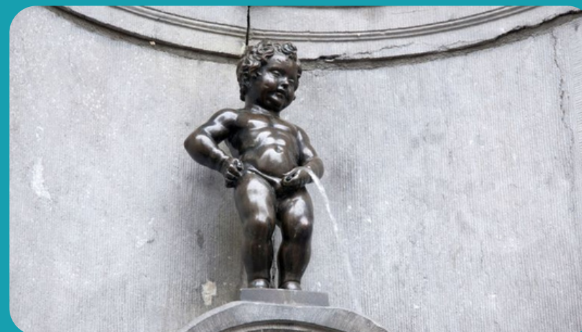
The Manneken Pis statue