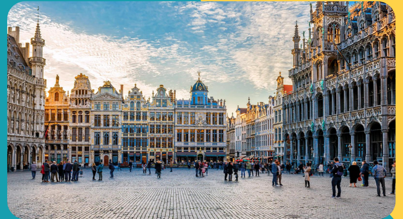
The "big place"