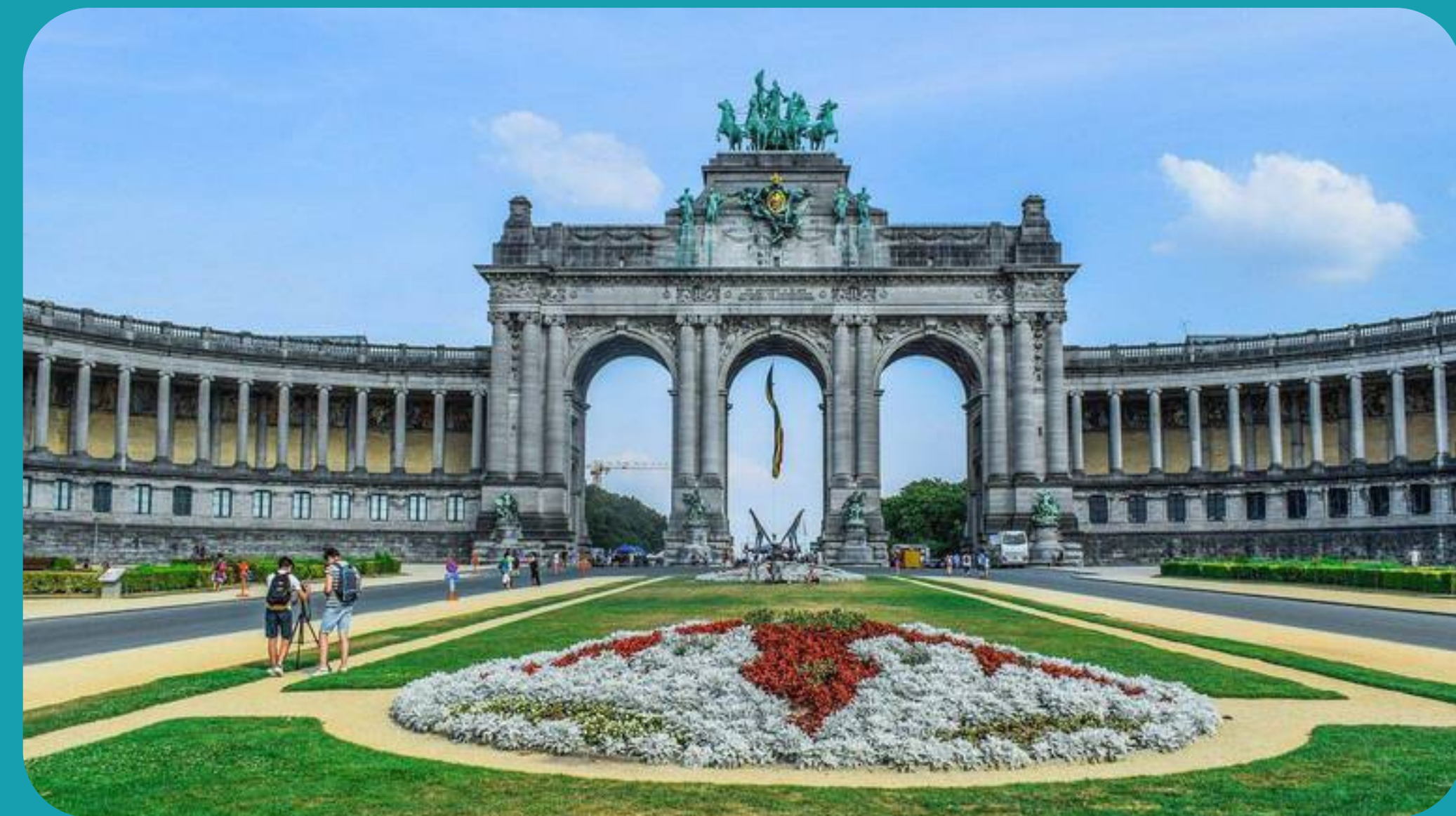
Park of the Cinquantenaire

With its superb architecture, its museums and its monuments (several of which are classified by Unesco), the capital of Belgium and, in a way, also of the European Union, offers many attractions to its visitors, including in its peripheral districts (Woluwe-Saint-Pierre, Ixelles, Saint-Gilles...).