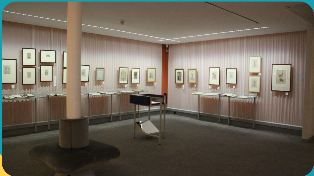
Félicien Rops museum