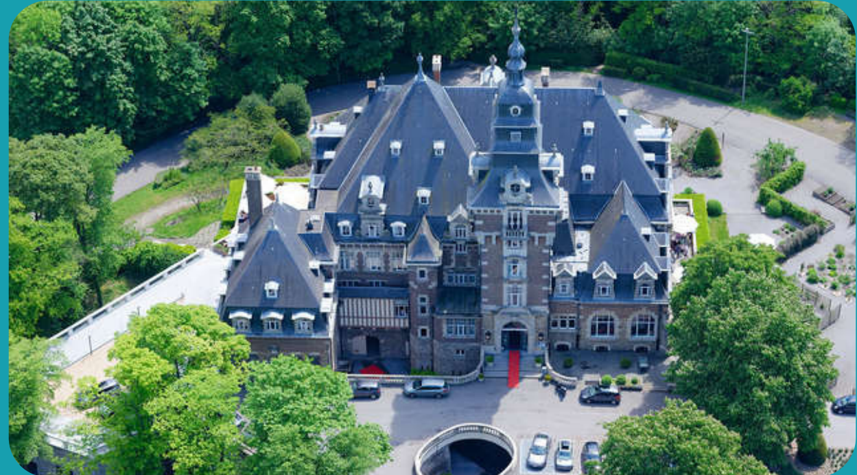
Castle of Namur