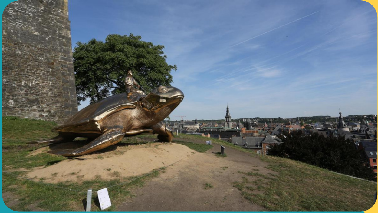
"Searching for Utopia"

Namur offers numerous activities, both cultural and sporting, giving you the opportunity to explore the city to its fullest extent in your free time.