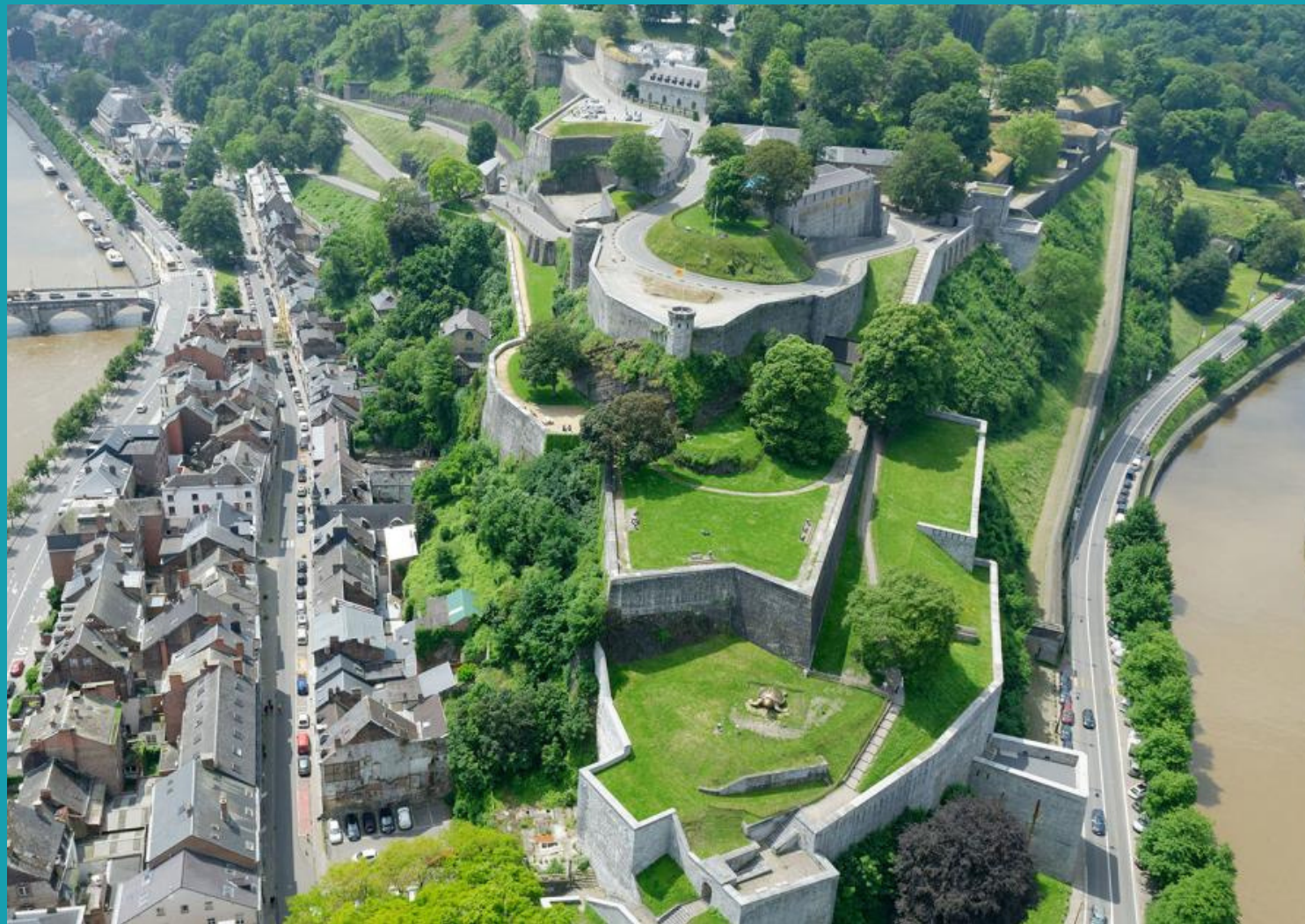
Citadel of Namur

Visiting Namur means strolling through the pedestrian area without hurrying, enjoying a beer on the old "Place du marché aux légumes" or walking to the Citadel. From the top of this spur, sheltered by one of the largest fortresses in Europe, the view of the old city is incomparable.