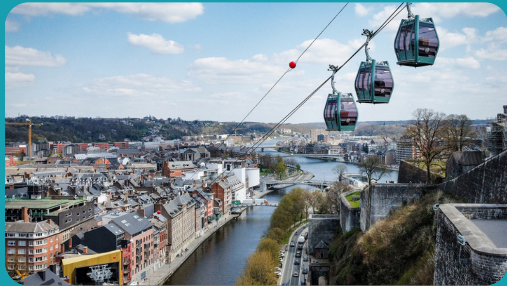
Namur's cable car